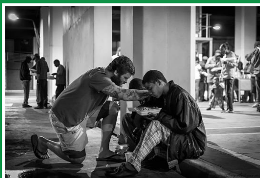
FEEDING THE HOMELESS

African countries. Please ensure that your passport is valid for at least six months after your date of departure from Africa. You are personally responsible for ensuring that passports, visas, vaccination certificates and other travel documents are in order and for all costs relating thereto.