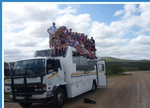
OVERLAND TOURING THROUGH SOUTHERN AFRICA

This popular backpacker's bus drives daily routes between the best backpackers and places of interest, making it very easy to travel by yourself or with friends. This Hop-On-Hop-Off bus starts in Cape Town or Johannesburg and offers flexible tickets to fit to your traveling needs. If you would like us to book any tickets for you, we offer a 5% discount .