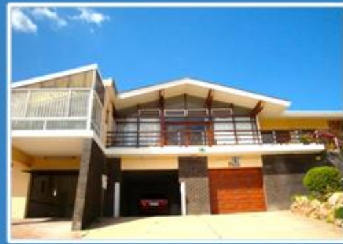
THE VOLUNTEER HOUSE AT THE BEACH

It is fully furnished and has all the facilities needed and more; two kitchens, two washing machines, a dining room and TV lounge with satellite TV, a garden with a swimming pool to cool off, great views of the ocean and 9 bedrooms offering a variety of sleeping options. Wireless internet is free; just bring your own laptop or any other device to access the Wi-Fi network.