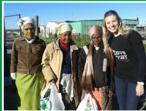
HANDING OUT FOOD PARCELS

For Love Story, there is a cause that inspires and stirs us to action, and that is the cause of the hungry. We've seen multitudes of hungry children and adults in our very own communities. They are just like those you read about - the kind that fight for their food, that walk the streets at night begging and the kind that turn to drugs and alcohol as substitutes for food. We are not referring specifically to the homeless but also to those who have homes and families, yet go without food due to unemployment and poverty.