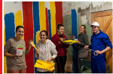
PAINTING A CLASSROOM